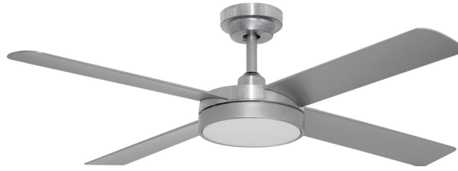
Brushed Aluminium with Silver Blade